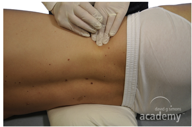
Figure 2 Trigger point dry needling (TrP-DN) applied over active TrPs in the quadratus lumborum muscle of a patient with mechanical low back pain.

rotations (fast in and fast out technique), at approximately 1 Hz for 25–30 s with the aim of eliciting different local twitch responses. In such a manner, the needle performed multiple insertions into the active TrP without removing it from the skin. Since TrP-DN sometimes induces post-treatment soreness, patients were advised to report any increase in their symptoms after the intervention.