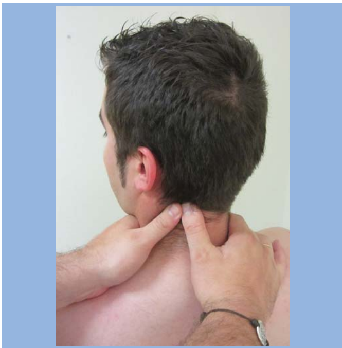
Figure 5. Sustained natural apophyseal glides in left rotation targeted to the C1/C2 joint. The therapist places the thumbs over the C1/C2 joint on the left side by applying a posterior–anterior and inferior–superior slide to the joint. The patient actively turns the head to the left in a pain-free range of motion.

Since there are close anatomical, functional and pathophysiological relationships between the cervical spine and the temporomandibular joint (TMJ) [110,111], some authors have suggested that the TMJ could also contribute to headache [112]. Two studies have determined that the inclusion of manual therapies targeted to the TMJ in combination with manual therapy targeted to the cervical spine was more effective for decreasing headache intensity and increasing neck function in patients with CeH [113,114]. These authors indicate that clinicians should